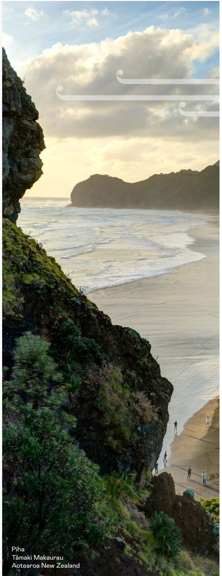
Piha Tāmaki Makaurau Aotearoa New Zealand

*Fidelity Life has an A- (Excellent) financial strength rating from A.M. Best. The rating scale that this rating forms part of is available for inspection at our offices. For more information please visit Fidelity Life's financial strength page .