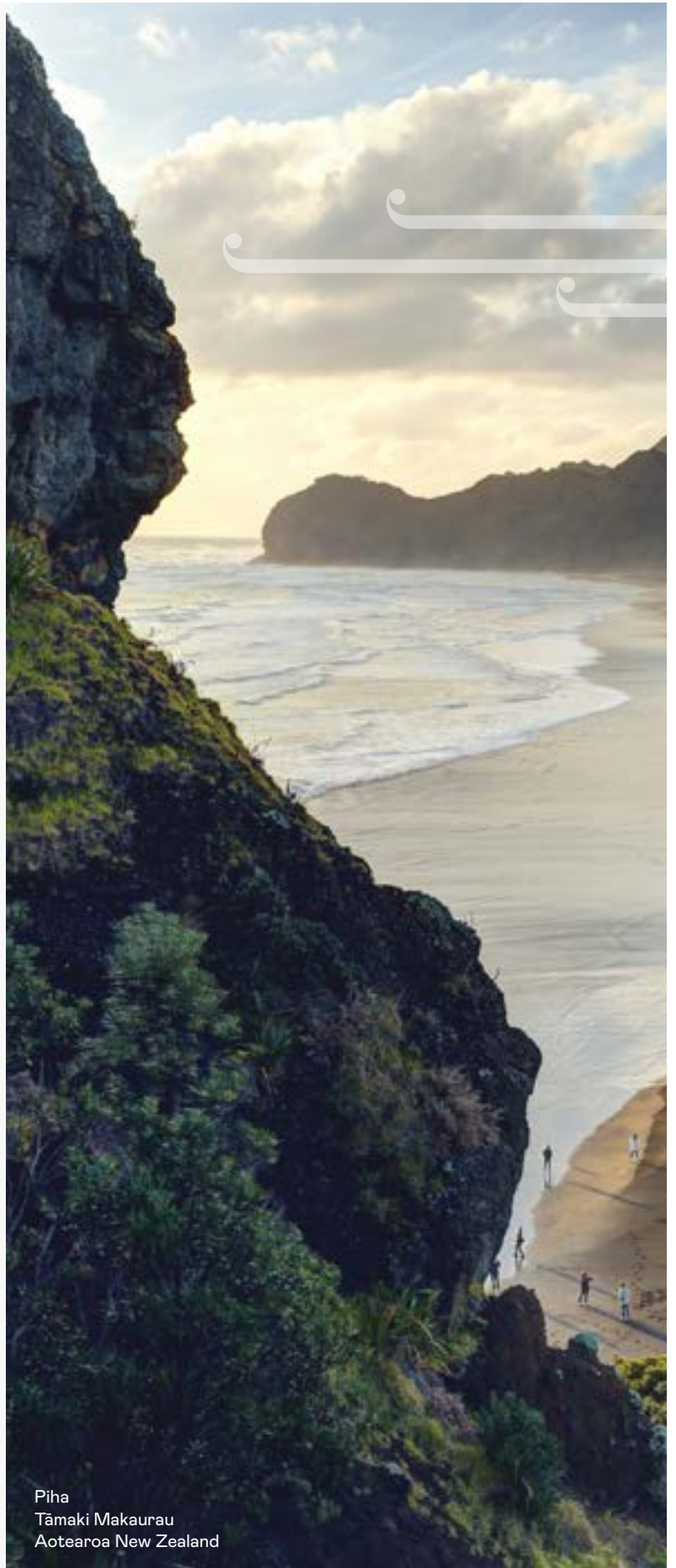
Piha Tāmaki Makaurau Aotearoa New Zealand

*Fidelity Life has an A- (Excellent) financial strength rating from A.M. Best. The rating scale that this rating forms part of is available for inspection at our offices. For more information please visit Fidelity Life's financial strength page .