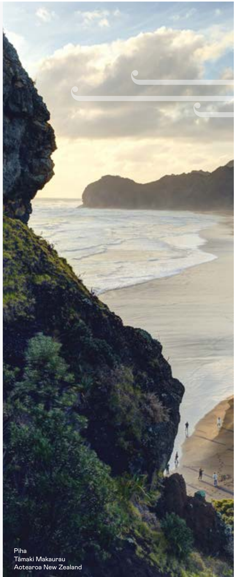
Piha Tāmaki Makaurau Aotearoa New Zealand

*Fidelity Life has an A- (Excellent) financial strength rating from A.M. Best. The rating scale that this rating forms part of is available for inspection at our offices. For more information please visit Fidelity Life's financial strength page .