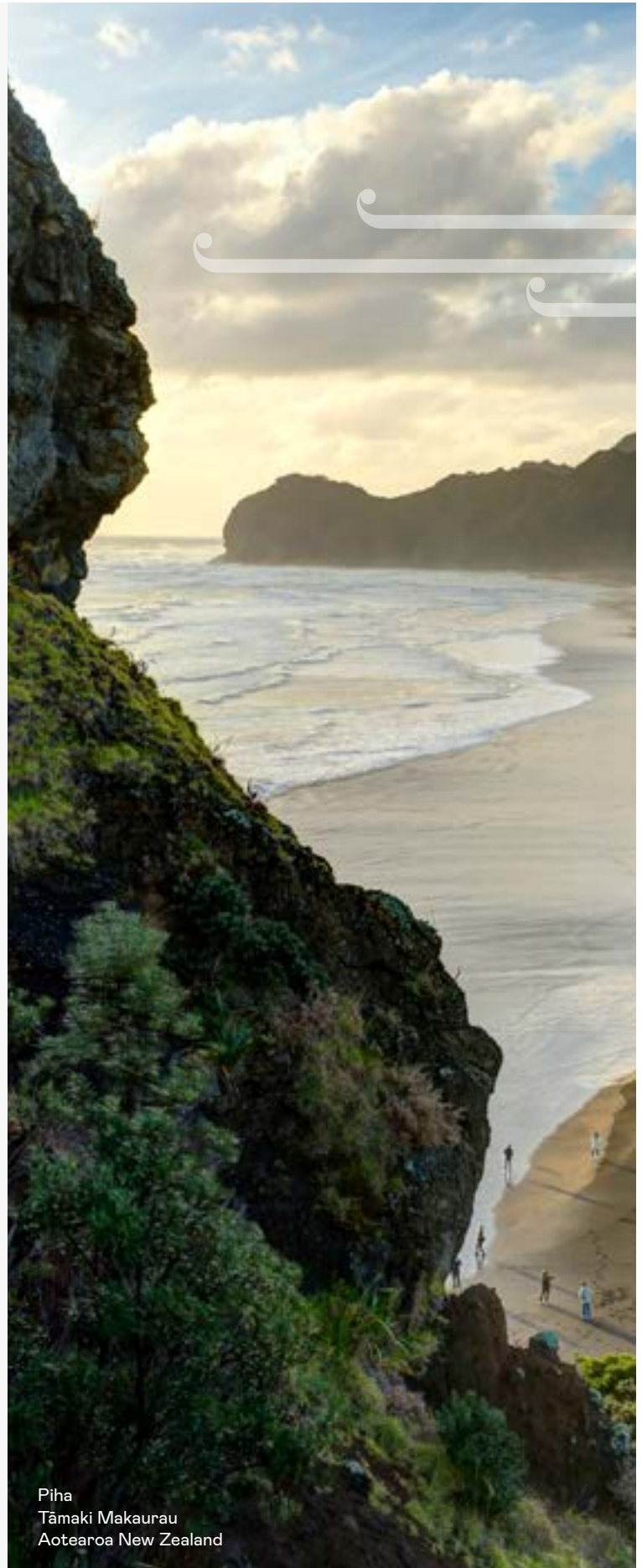
Piha Tāmaki Makaurau Aotearoa New Zealand

*Fidelity Life has an A- (Excellent) financial strength rating from A.M. Best. The rating scale that this rating forms part of is available for inspection at our offices. For more information please visit Fidelity Life's financial strength page .