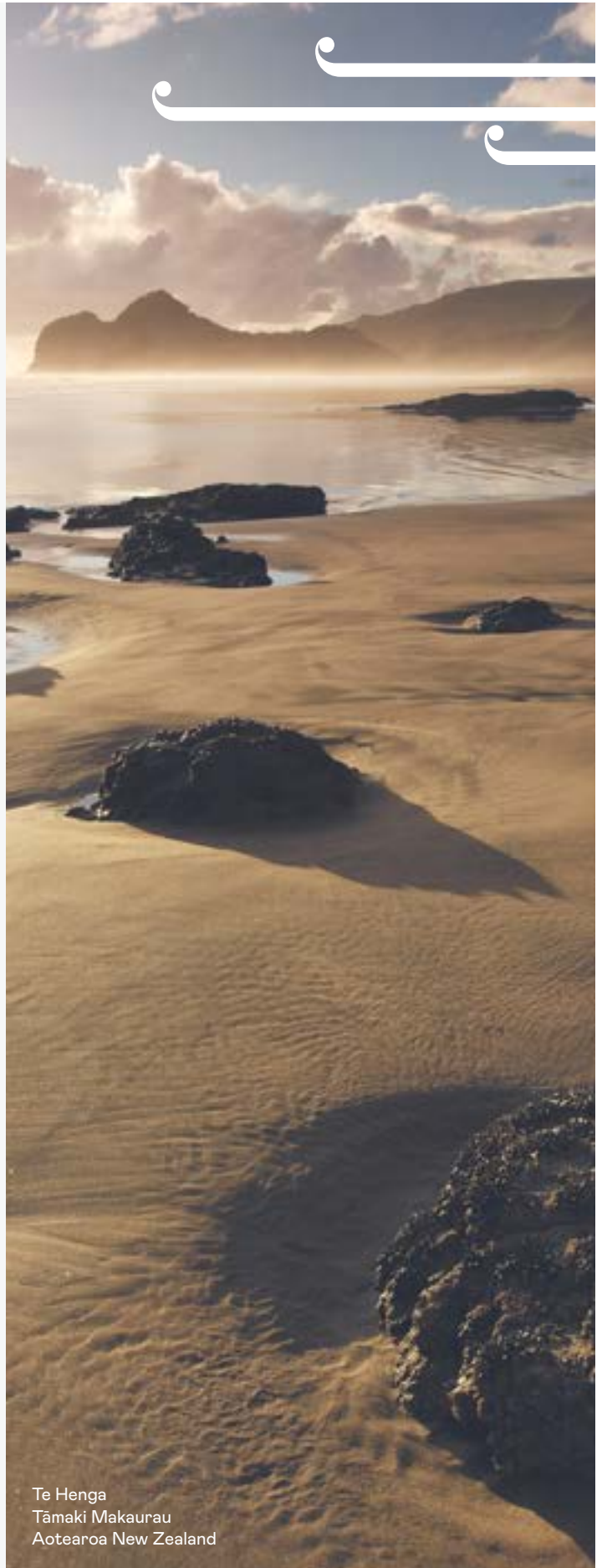
Te Henga Tāmaki Makaurau Aotearoa New Zealand

*Fidelity Life has an A- (Excellent) financial strength rating from A.M. Best. The rating scale that this rating forms part of is available for inspection at our offices. For more information please visit Fidelity Life's financial strength page .