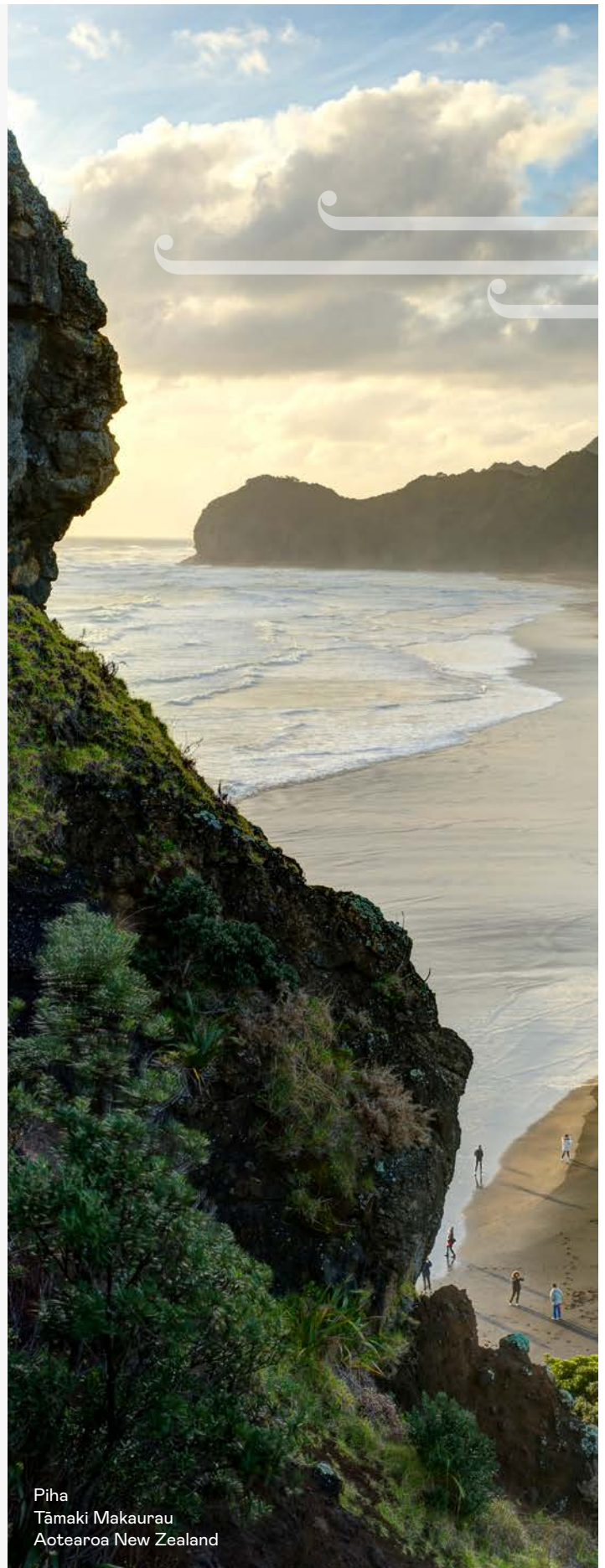
Piha Tāmaki Makaurau Aotearoa New Zealand

*Fidelity Life has an A- (Excellent) financial strength rating from A.M. Best. The rating scale that this rating forms part of is available for inspection at our offices. For more information please visit Fidelity Life's financial strength page .